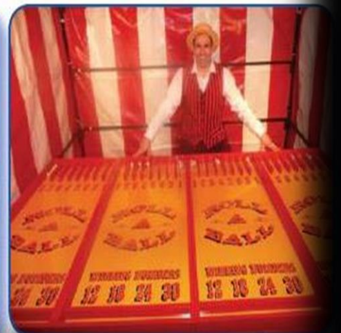
Roll a Ball Game