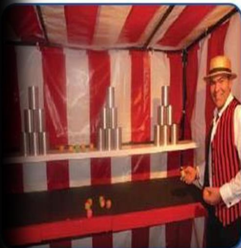
Tin Can Alley