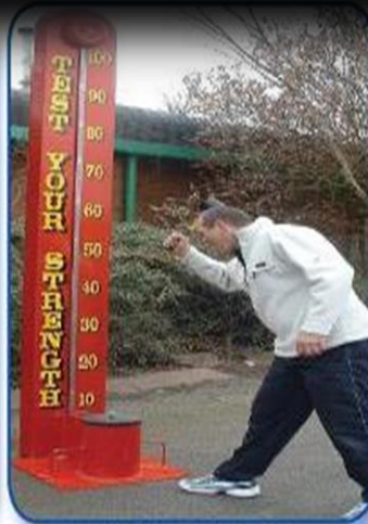
10ft High Striker