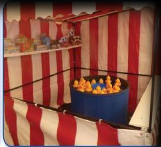
Hook a Duck