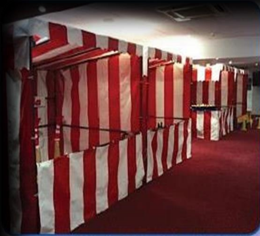
Fairground Stalls 8ft x 8ft x 7'6" high